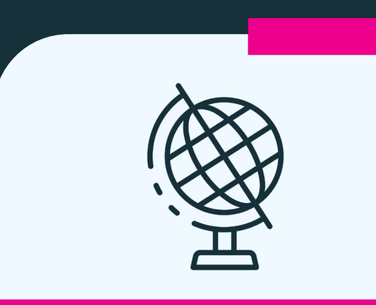
Competitive Operational Delivery

UK Therapeutic Cancer Prevention Network Group